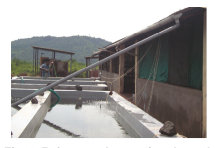
Fig. 1: Rain water harvesting through (U Shape) gutter

In experiment, the five days old healthy spawn of Catla catla having average length 5.50±0.04 mm and average weight of 10.99±0.30