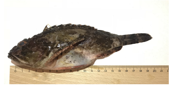
Fig. 2: Scorpaena porcus from Sinop coasts of the Black Sea