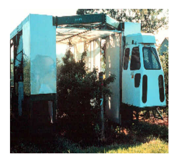
Fig. 2.3: Tunnel sprayer