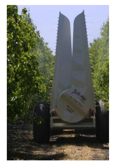
Fig. 2.2: Tower Sprayer