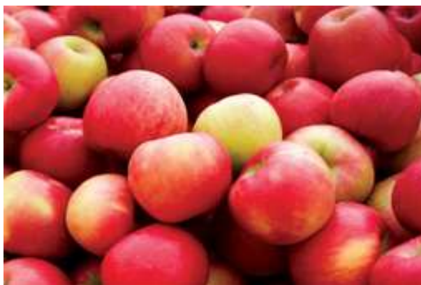
Figure 3 – Legend for figure 3

This section should follow results, deal with the interpretation of results, convey how they help increase current understanding of the problem and should be logical. Unsupported hypothesis 1 should be avoided.