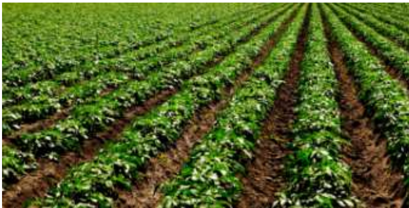
Figure 1 – Legend for Fig. 1 to be typed here

The Introduction should lead the reader to the importance of the study; tie-up published literature with the aims of the study and clearly states the rationale behind the investigation 1 .